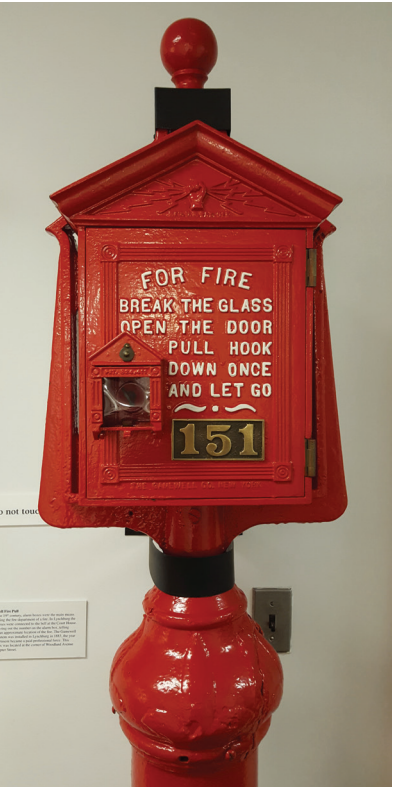
A NEW YEAR WELCOMES NEW EXHIBITS TO THE LYNCHBURG MUSEUM!