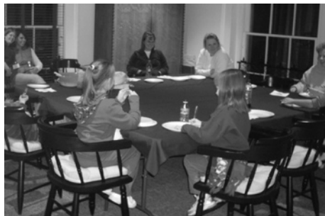
Kids and parents participated in "Lights Out" sleepovers at the Museum and Point of Honor.

If you are interested in helping, please send your donation to the Lynchburg Museum Foundation, Box 529, Lynchburg, VA 24505 and note that it is for the clock project. The Foundation is a not for profit 501-c-3 organization and gifts are tax deductible. Will you help the clock tick and the bell ring once again?