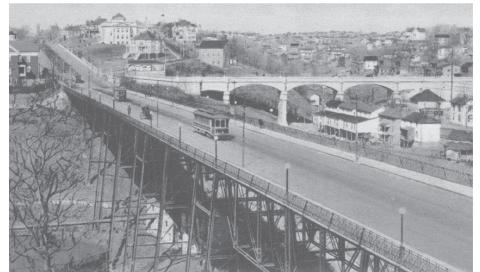
Rivermont Bridge in foreground, current D Street Bridge on right, circa 1915

It will be approximately two years before this connector will be back in service. In the meantime, Daniel's Hill and Point of Honor traffic must use Cabell Street off Rivermont Avenue for access.